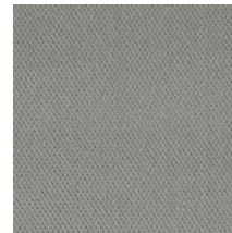
Ice Field 620