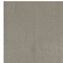
Arrow Head 6827