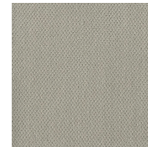
Snow Cap 6319