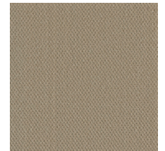
Soft Pine 6317