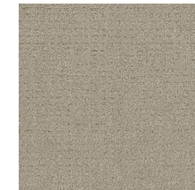
Moon Mist 6006