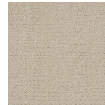
Champagne Fizz 6309