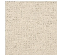
Vanilla Whip 6022