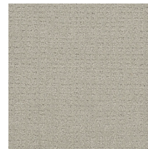
Snow Cap 6319